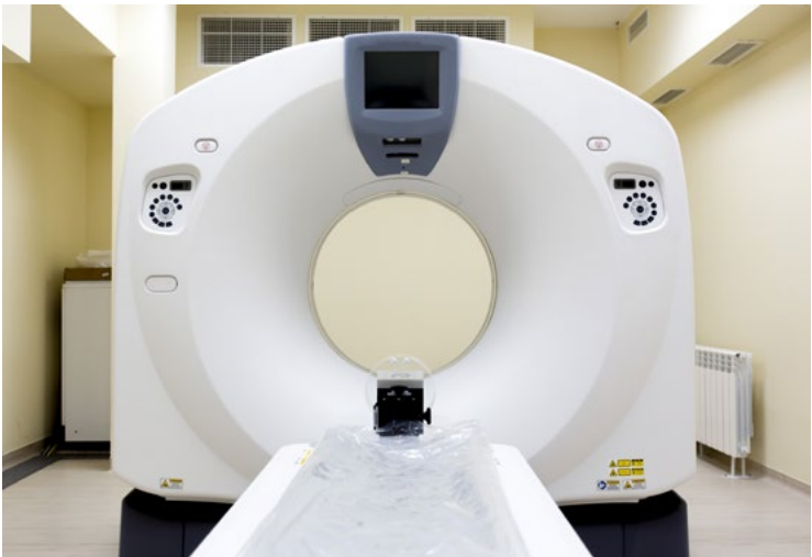
The most common imaging technology used to evaluate people with suspected TBI is computed tomography or CT.