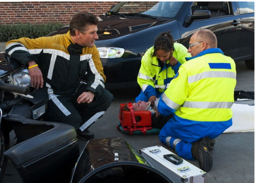
Vehicle-related injuries are the third most common cause of TBI.

Additional information about TBI and its causes can be found on the U.S. Centers for Disease Control and Prevention TBI website: http://www.cdc.gov/TraumaticBrainInjury/ .